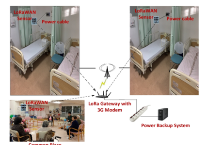
Fig. 2: LoRaWAN setup in the caregiving center.

sensors' ultimate data transfer capability in terms of packet loss. In a caregiving center, our setup has 42 LoRaWAN sensors for these research works (Fig. 2). We also studied different types of environmental sensor data in the healthcare center to analyze data transfer performances.