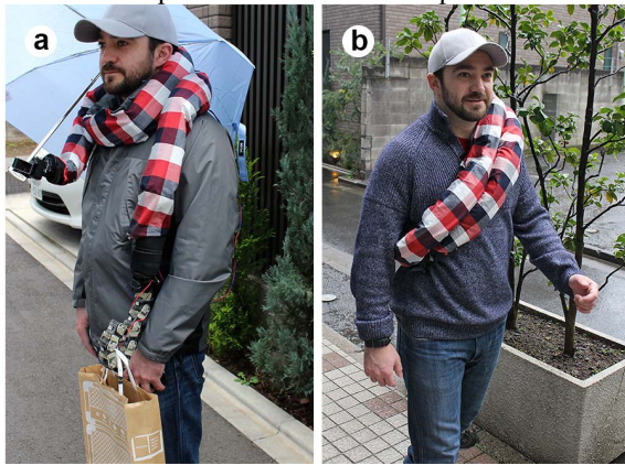
Fig. 1. (a) Orochi is a multipurpose daily worn robot that can be used across a wide variety of daily contexts, (b) its flexible design allows it to be worn in multiple ways whilst being unobtrusive.

In this project, we developed a snake-shaped supernumerary robotic limb that we called Orochi. The robot attempts to fulfil three design considerations (Fig. 1), which are multipurpose use, wearability by context, and unobtrusiveness in public. We used Orochi to address the first and second research questions, by conducting a series of focus groups and a survey to investigate how a multipurpose SRL may be used on daily basis, and how it is perceived when used in public.